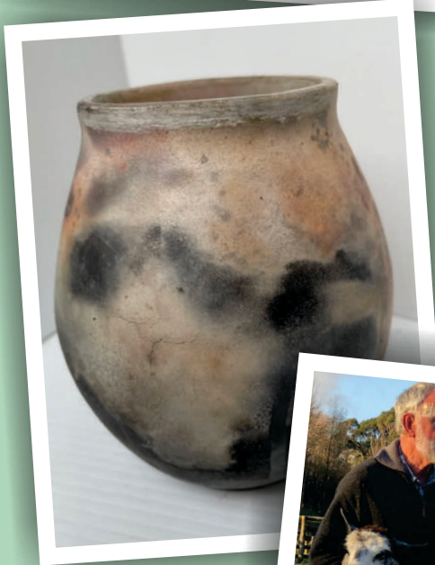
Class Fit Firing