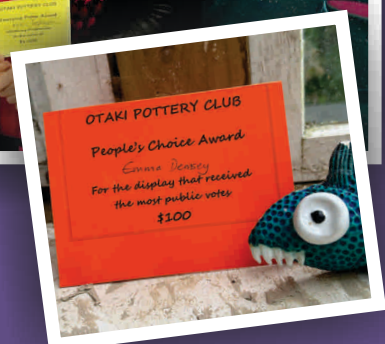
Award winners from Star Glaze