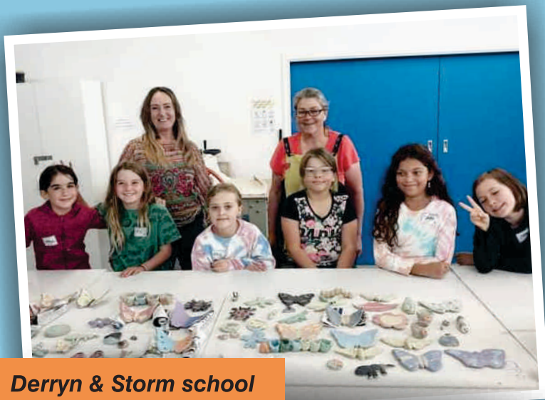
Derryn & Storm school holiday program