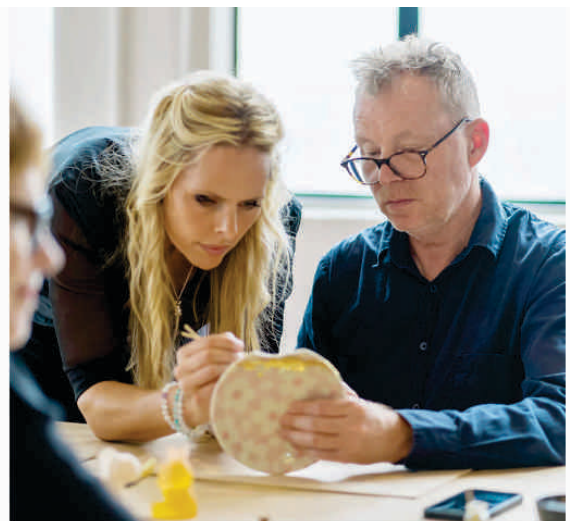
Kintsugi – or kintsukuroi

Bring along a piece of your pottery to restore. Materials are provided.