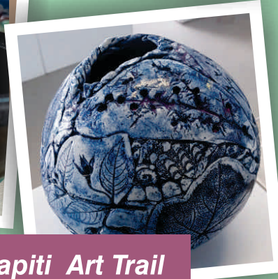
Artists work in the Kapiti Art Trail