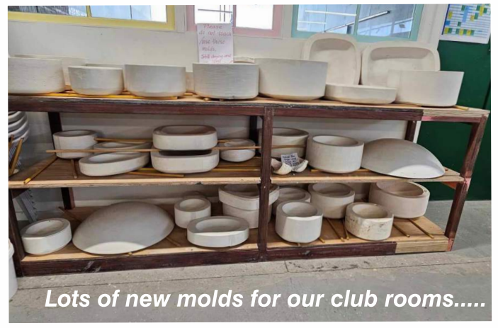
Lots of new molds for our club rooms.....