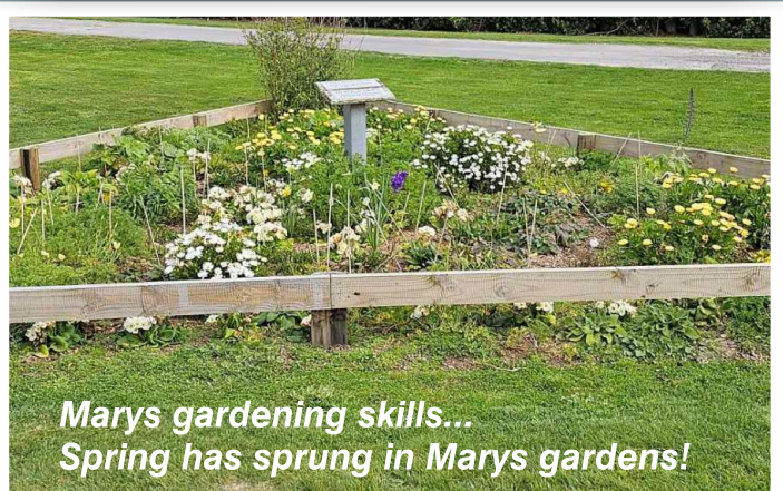
Marys gardening skills... Spring has sprung in Marys gardens!