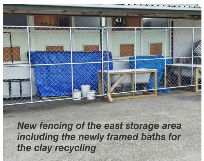
New fencing of the east storage area including the newly framed baths for the clay recycling