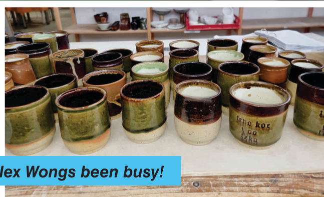
Alex Wongs been busy!