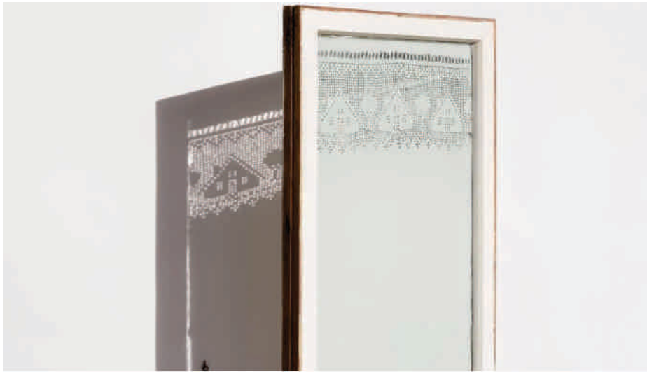
A crochet curtain is used as a template with which to etch the cotton details into a glass window pane.

https://www.thepost.co.nz/ culture/350117140/crocheted- curtains-and-life-shaped-21 -houses