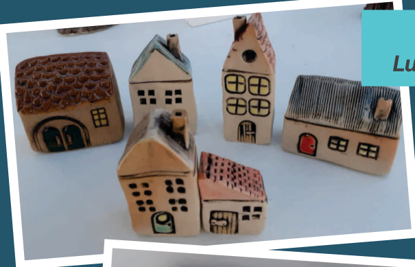
Houses by Luci Robbins

Defibrillator: is installed and if you ring 111, they will give you the code to open it alternatively it is noted on the whiteboard.