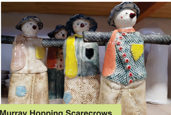
Murray Hopping Scarecrows