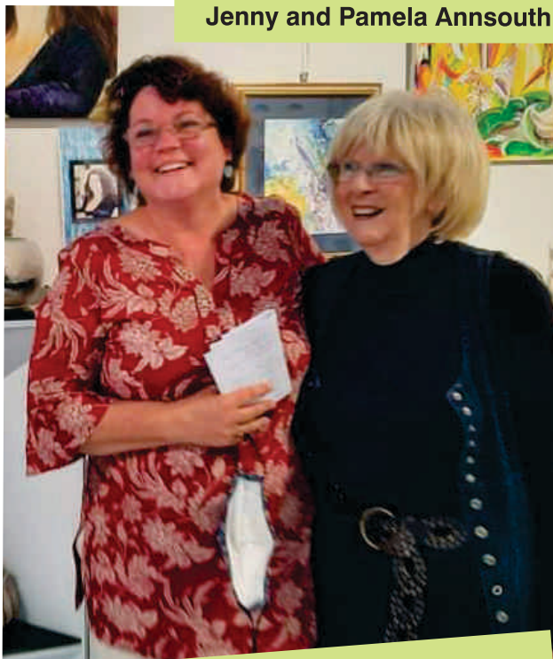
Tote Modern Exhibition Opening