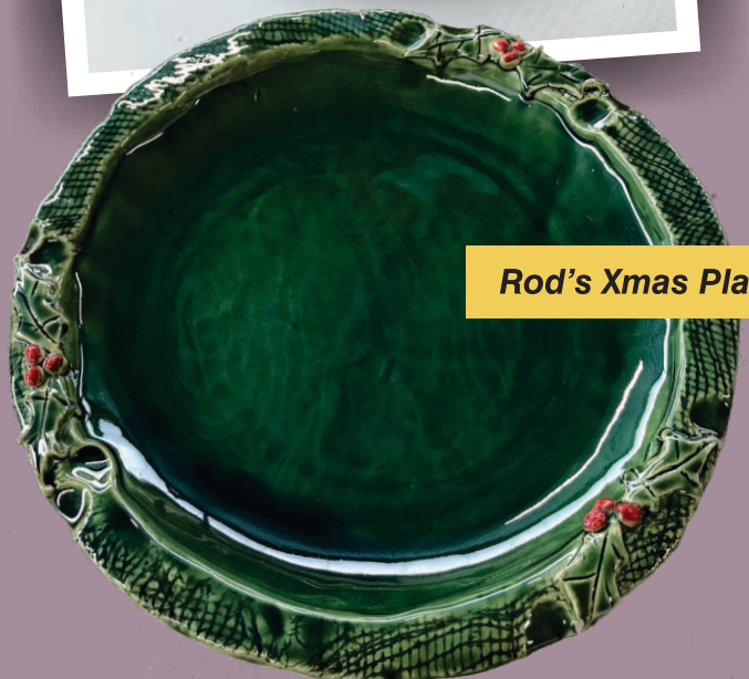
Rod's Xmas Platter