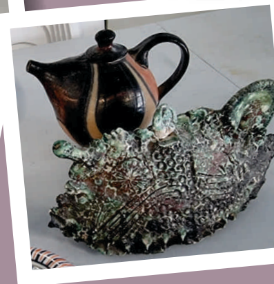
Jenny Shearer Teapot examples