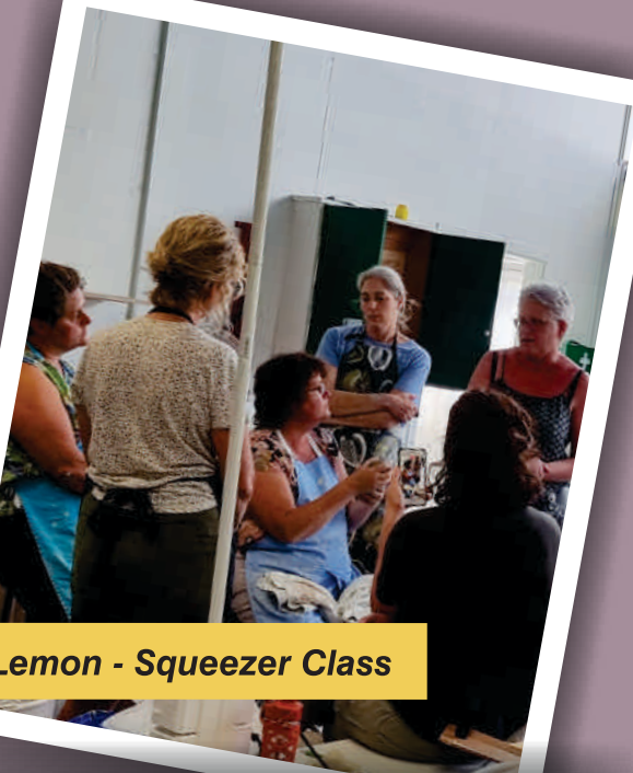
Jenny's Lemon - Squeezer Class