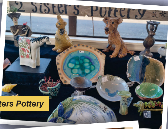
2 Sisters Pottery

Clay, Kilns and Glazes: The Clay team need someone to help with stock recording. If you can help please contact Rod. Kiln No. 2 required a new probe and again we are very grateful to Trevor Wright for stepping in and fixing the problem.