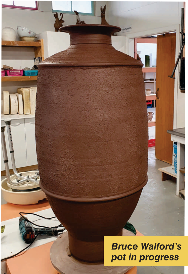
Bruce Walford's pot in progress