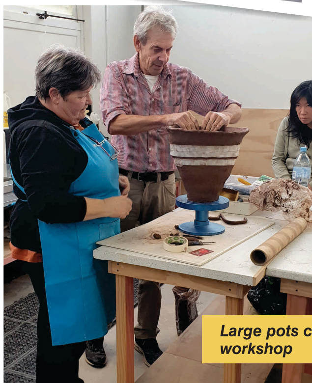
Large pots coil workshop