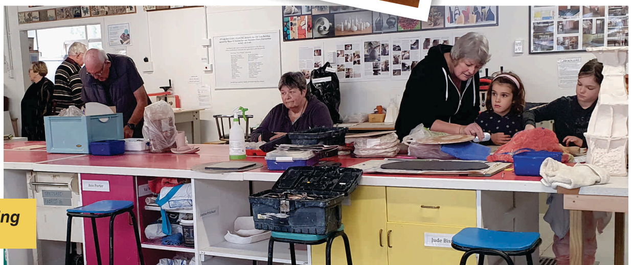
Tile making session