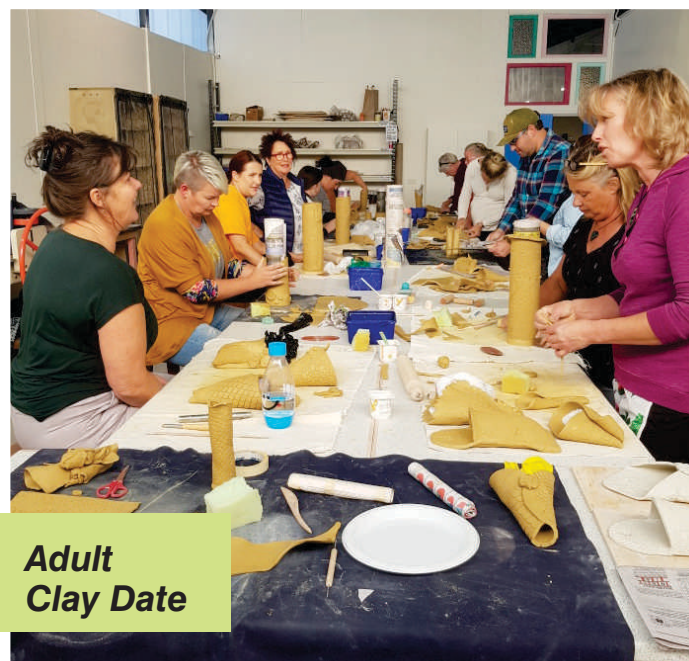
Adult Clay Date