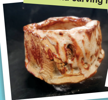
Kurinuku carving method