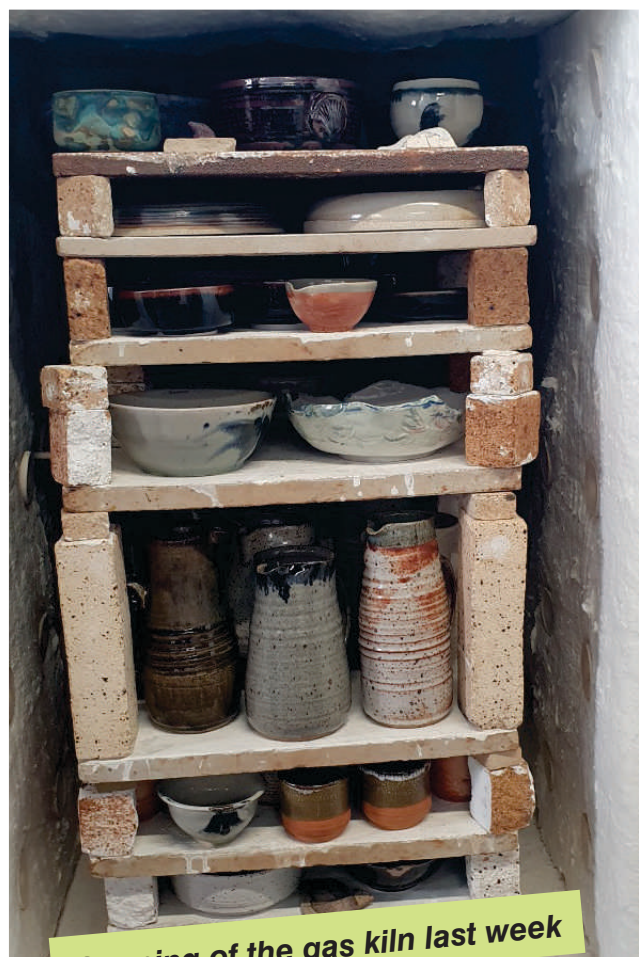
Opening of the gas kiln last week