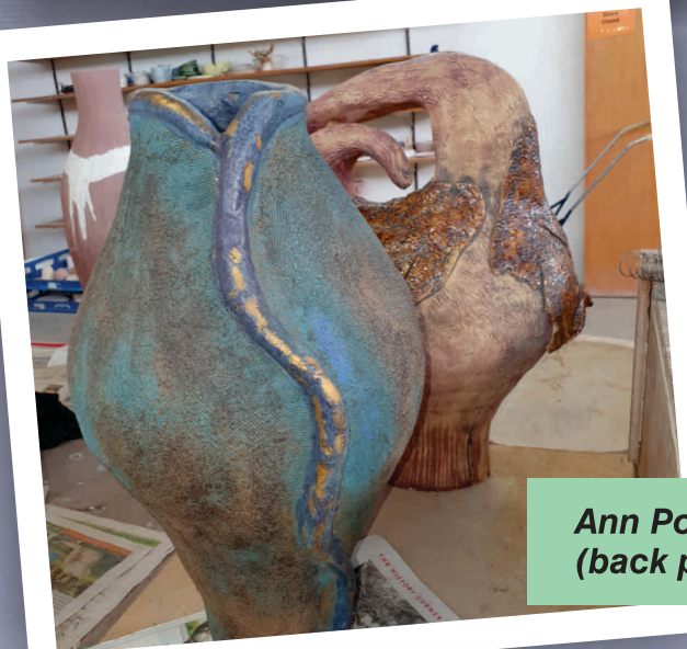
Ann Porter (back pot)