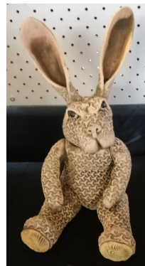
Fiona Tunnicliffe - Guest Artist

CLAY STOCKS: For those who ordered new clays from Germany, these will be available from March 1 st