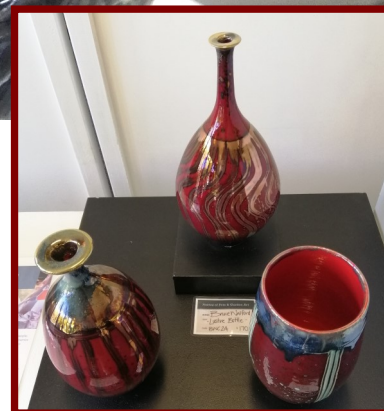
Guest artist - Bruce Walford

P O Box 36 OTAKI 5512 Ph. 06 364 7308 x 711 www.otakipotteryclub.org