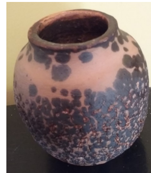
Sandra Sinclair —Obvara