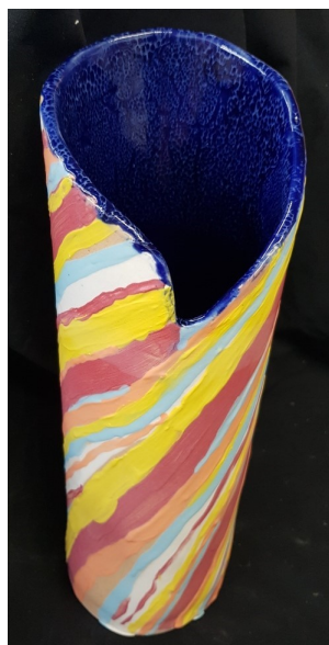
Heads, Figure, and Vase by Val Waugh