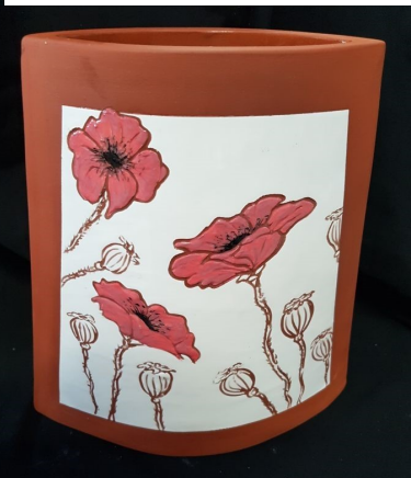
The Claydate Programme