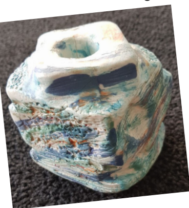
An example of the Japanese Kurinuki technique recently undertaken by the Friday morning hand-building class.