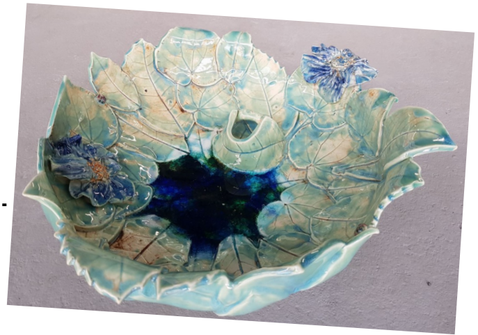
Jojo Hare - water feature