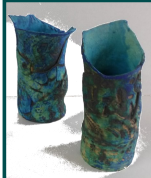
Pots by Liz Earth