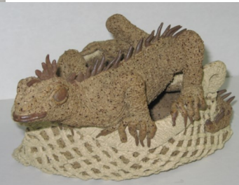
Lizards By Erryl White