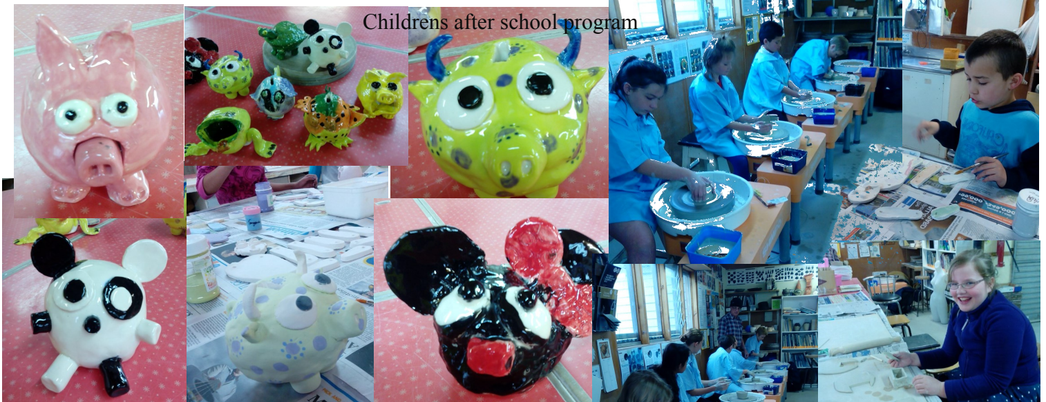
Childrens after school program