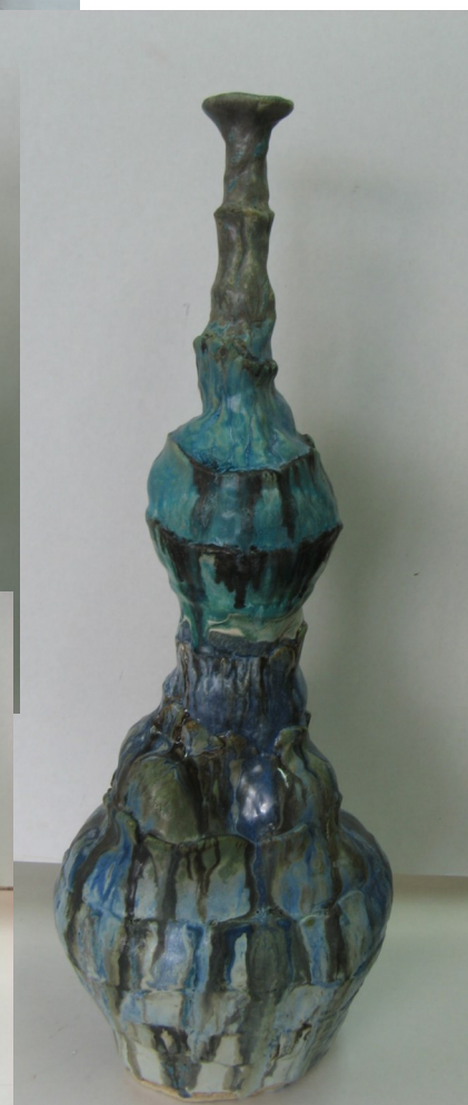
Big Pot and details - Duncan Smith