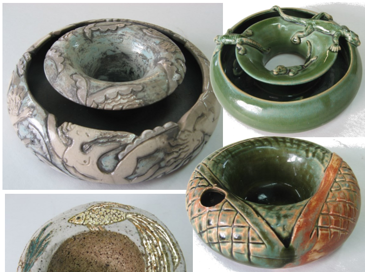
Double walled pots. - Jenny Daysh