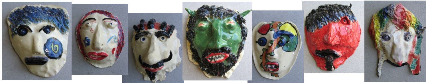
Masks by Year 7&8 College students