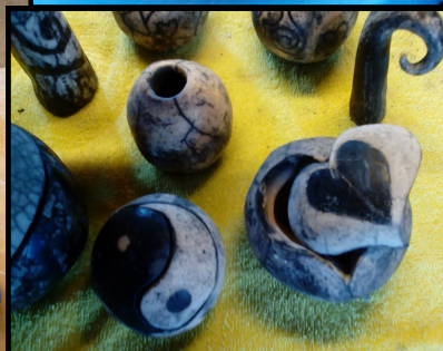
Various stages of the Naked Raku Workshop

The Club Raku, including adult students held last Saturday was a great success with great colour. The Naked Raku results were somewhat more encouraging too. Despite rain forecast for the whole day nothing eventuated and the day was warm with a gentle breeze.