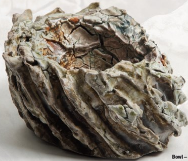
Bowl - Danyl Frost