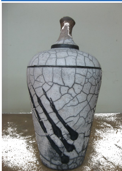
Naked Raku Bottle - Mike Page