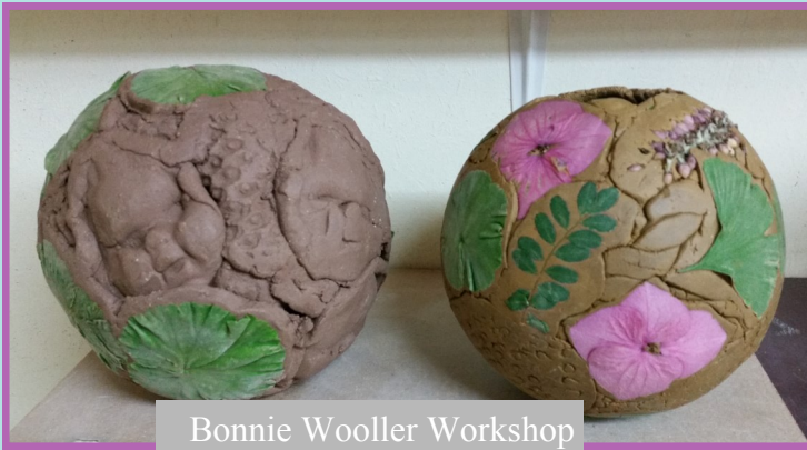
Bonnie Wooller Workshop