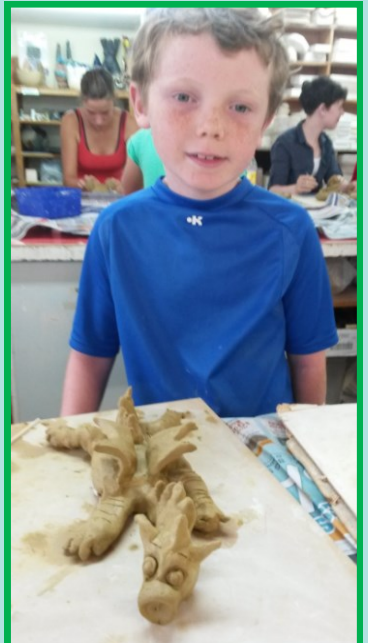
Finished my Dragon