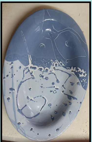
Terracotta Platter by Stephanie Tidman

Metallic glazes such as overglazes and raku glazes, will oxidize over time. The oxidation can be cleaned with silver polish, or concentrated lemon juice. To reduce oxidation, keep pieces out of the sun.