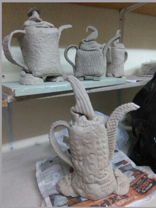
Funky Teapots -

http://www.kapiticoast.govt.nz/whats-on/things-to-do-in-kapiti/Kapiti-Arts-Trail/