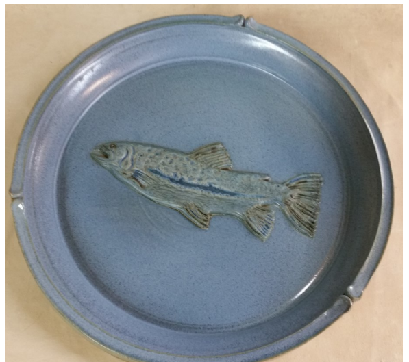
Fish Platter by Judy Page