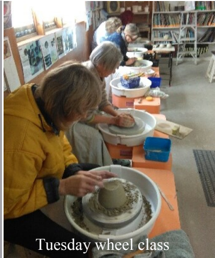
Tuesday wheel class