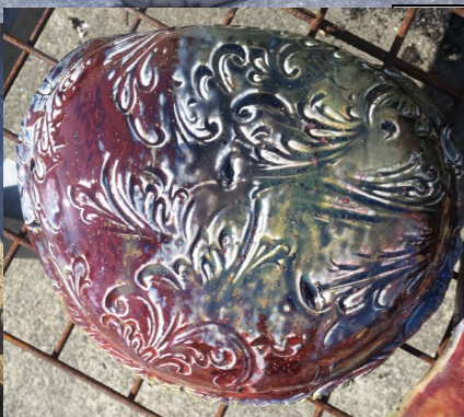
Photos from Club Raku day