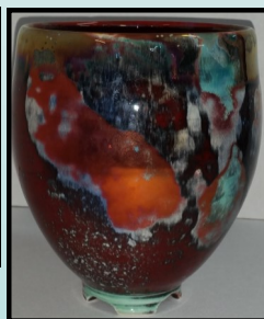
Examples of Bruce Walford's work