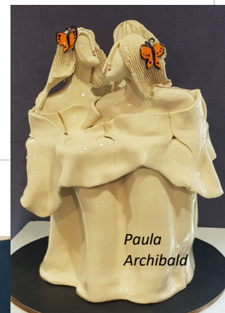
Some of the work of the Mentoring Group - the exhibition in the art space in the Otaki Library