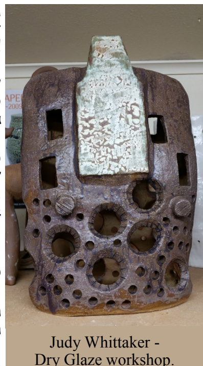
Judy Whittaker - Dry Glaze workshop.

People are still avoiding the latter, so after they leave and the benches dry, they leave behind a fine smear of dust.