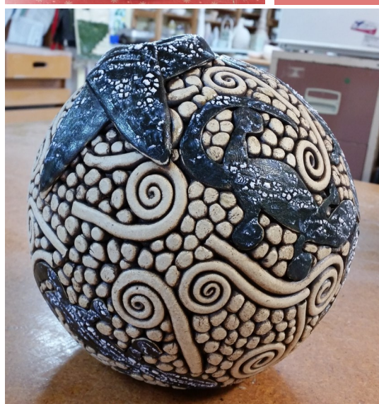
May Hastings - Orb Green Engobe and beading glaze on the lizards Manganese wiped back on the main body.