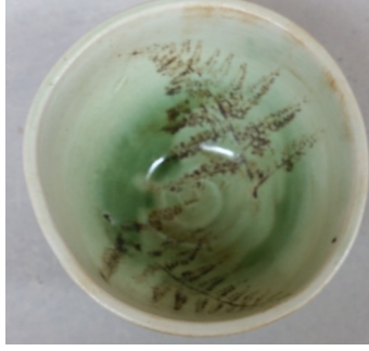
Bowl - Lucy Potter