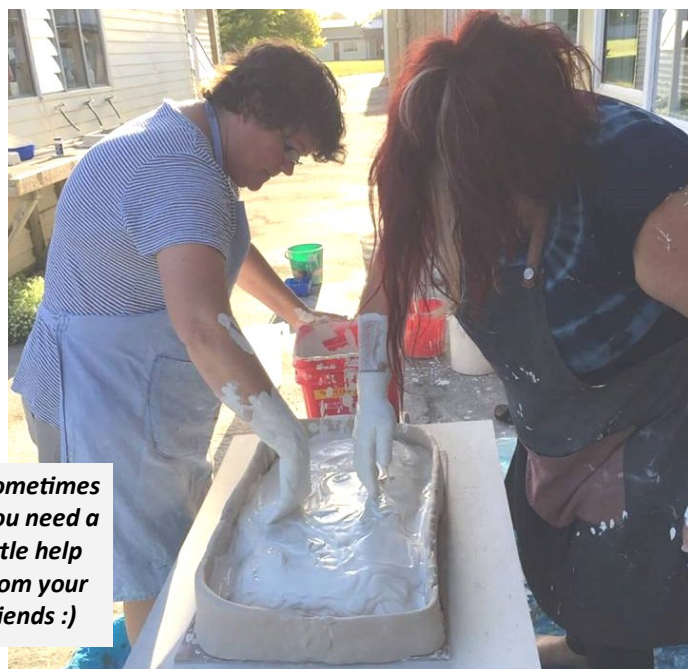
Sometimes you need a little help from your friends :)