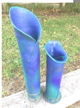
Festival of Pots