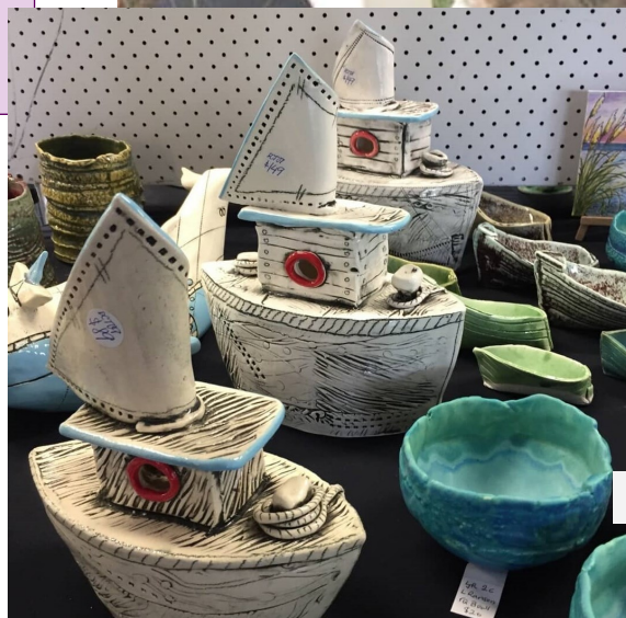
Festival of Pots