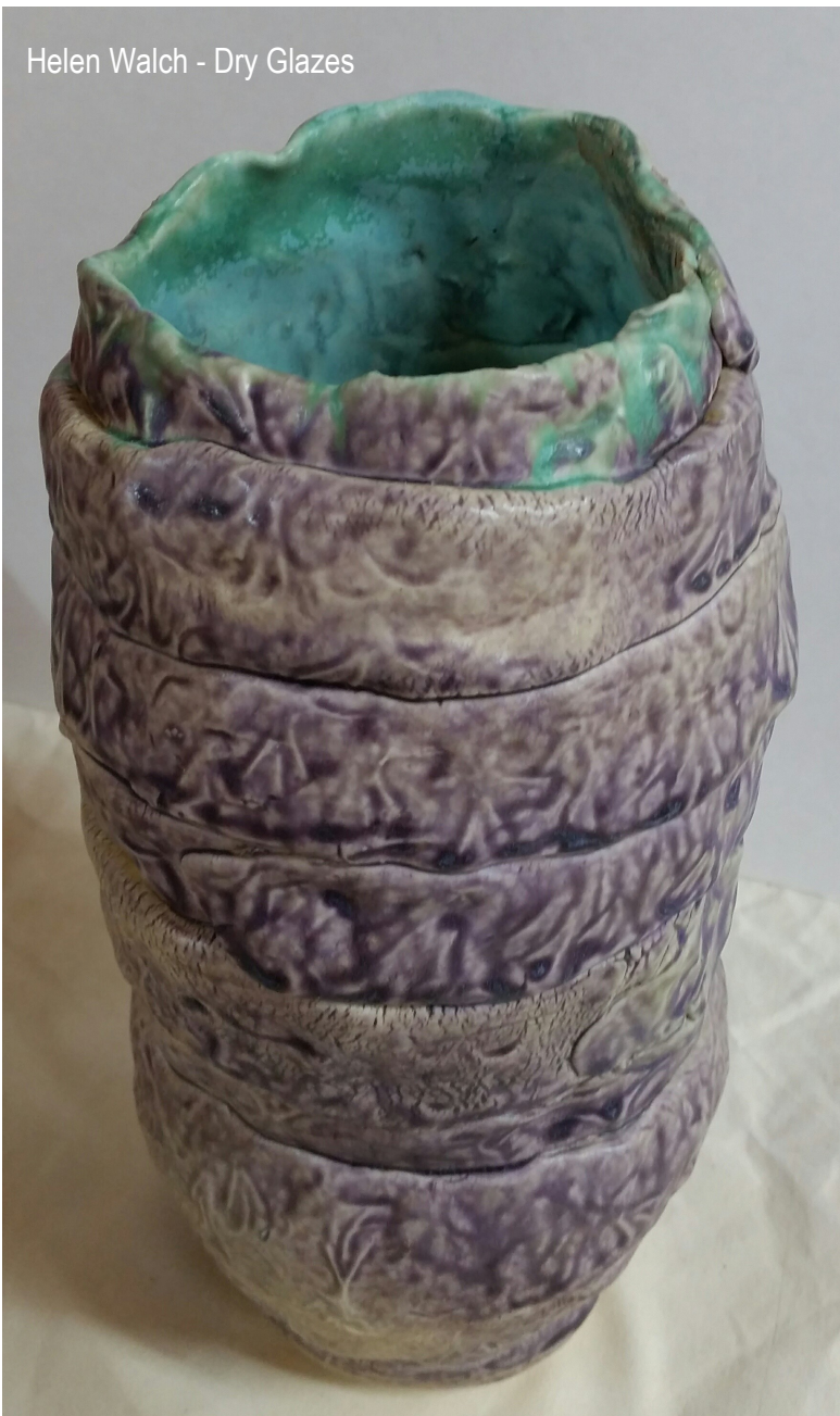
Helen Walch - Dry Glazes

Have you helped at a cleaning bee this year? As a requirement for full members, please add your name to the sheet in the Club Room. Dates for remaining cleaning bees are: 15 th July, 16 th September, 9 th December. Alternatively, you can pay $30 to cover your cleaning contribution. Please contact Stephanie to discuss.