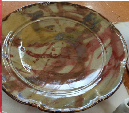
Plates - Jenny Turnbull